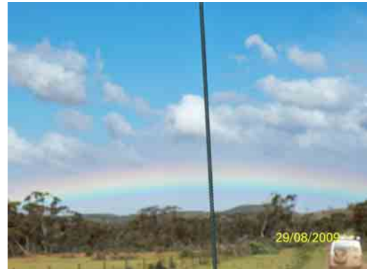
Rainbow seen on trip

We experienced heavy showers of rain on and off during the night, but the wind just gusted until the early hours of Sunday morning. Sunday morning was beautiful with a little sun shining through the clouds, but then the showers arrived again, along with the wind .. again.